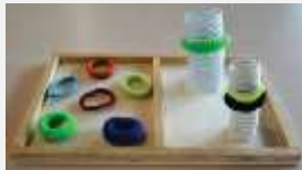
Play with homemade toys