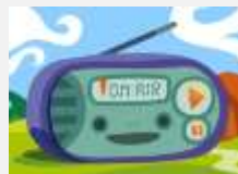
Appropriate use of DTs